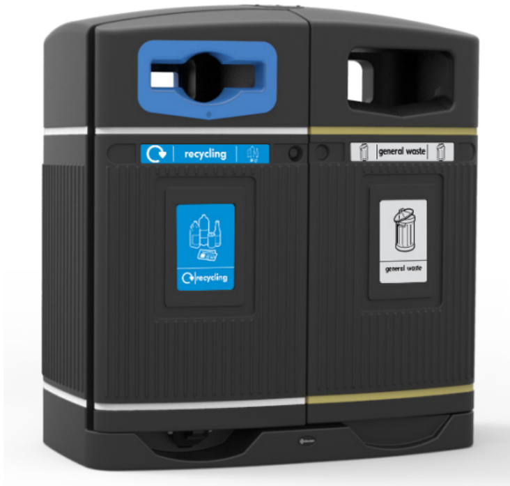
Figure 6: Jubilee Recycling litter bin

A different dual recycling bin is proposed for the remaining shopping areas which is in keeping with the Plaza litter bins already in place