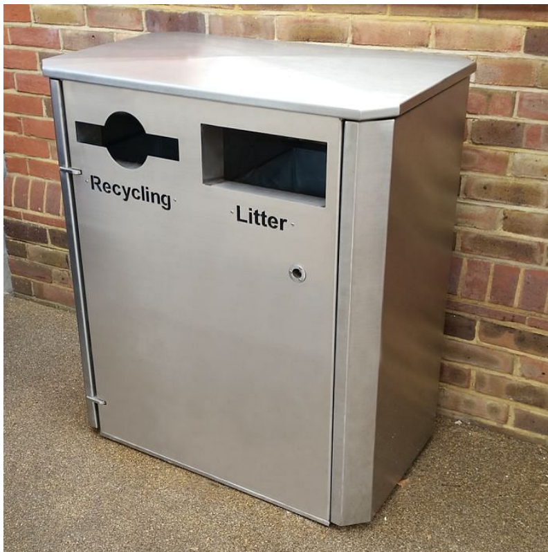
Figure 5: Derby Double stainless steel recycling bin

In keeping with the style of the Camberley High Street, the Derby Double Stainless Steel Recycling bins is recommended, please see image below