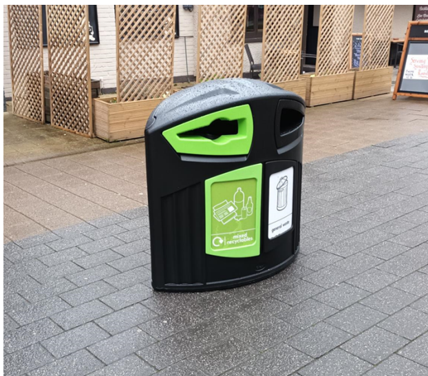
Figure 3 – Glasdon Nexus bin

As shown in the image below, these bins provide users with the ability to recycle a range of materials 'on the go'. This represents a significant enhancement to the old service, whereby all litter bin waste was collected and disposed of as general waste. By placing the bins in prominent locations, there is also the added benefit of promoting recycling and driving positive resident behavior.