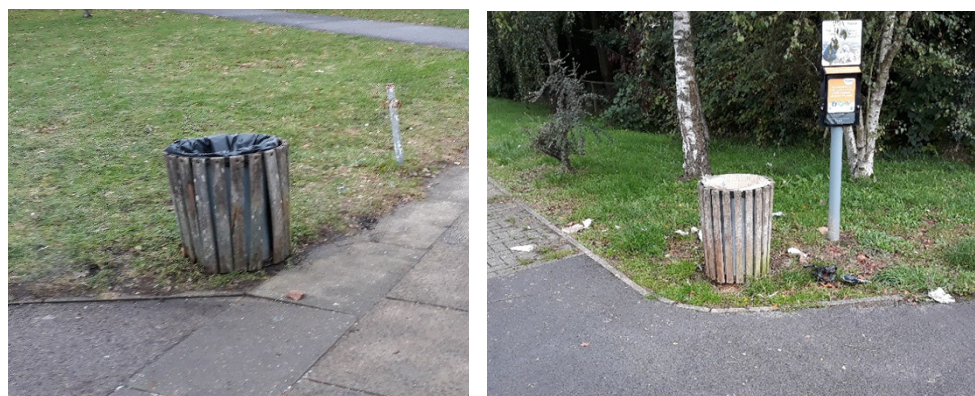
Fig 1: Old wooden bins

The original style of litter bins introduced to Surrey Heath were small open top wooden bins. The open wooden bins are prone to wear and tear which can be a hazard for the collection operatives with sharp edges and splinters. Furthermore the contents of the bins are easily accessed by foxes and other wildlife which leads to increased litter spillages and complaints from residents. Over the years many of these wooden bins have been replaced with plastic closed top bins. However there are still 62 old wooden bins remaining within the Borough, with examples shown in Figure 1;