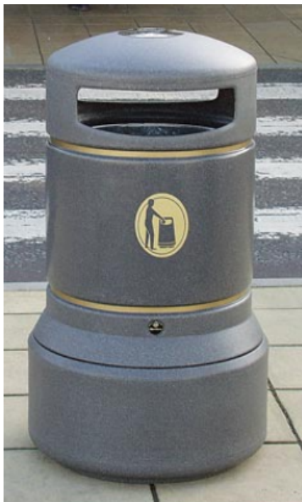
Fig 2 Glasdon Plaza litter bin

The first recommendation is to remove and replace the remaining 62 old wooden litter bins with standard plastic closed top bins. As outlined in the previous section, the old wooden bins are considered outdated, dangerous for the collection operatives and users and in many cases cause local street scene issues as wildlife can easily access the contents. We would recommend the new bins to be standard Glasdon Plaza bins as these are already used throughout the Borough.